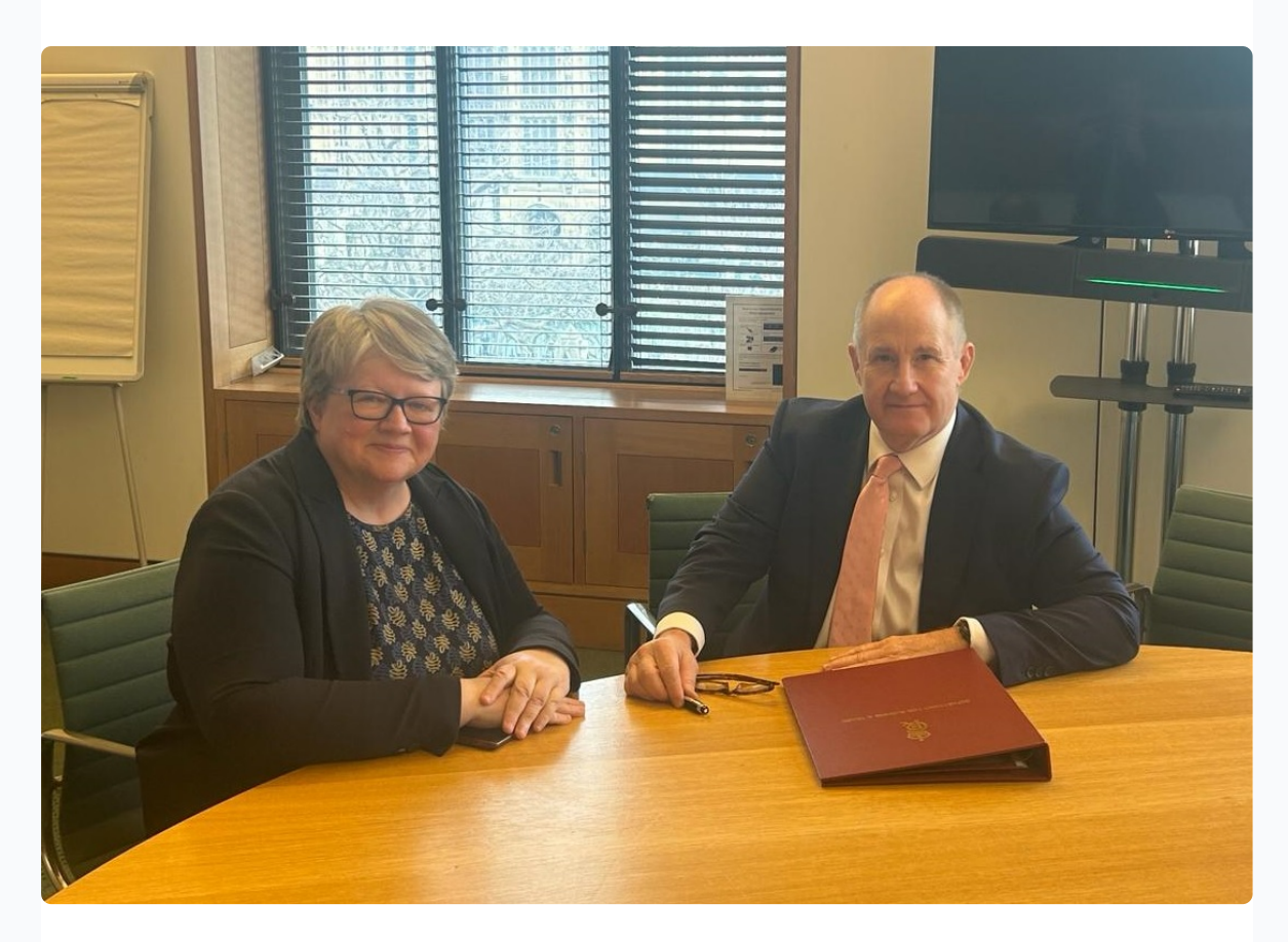
Crime & Policing: I met Suffolk's Police and Crime Commissioner, Tim Passmore. We discussed several issues including anti-social behaviour, shoplifting, drug crime and the role of police in the closures of the Orwell Bridge.

take this up formally with the Post Office.